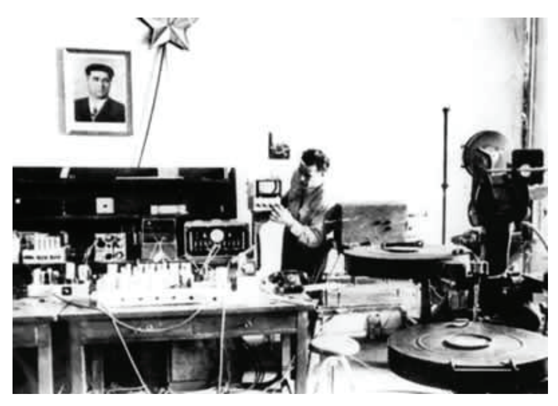
Figure 1. The birth of TV in Bulgaria.

The early history of television in Bulgaria closely resembles that of its neighbour, Romania, and could be characterised by what Mustata<sup>12</sup> calls an 'era of scarcity' where the medium lacks 'clear aesthetic, professional or institutional identity'. The first experimental work on transmitting images was initiated in 1951 by a group of enthusiasts affiliated with what is today known as the Technical University in Sofia.<sup>13</sup> By May of 1953, the first over the air broadcast was