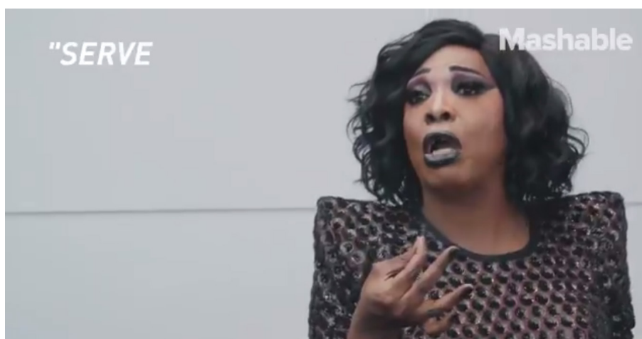
Video 6. Mashable's 'RuPaul's Drag Race queens teach us the language of drag'