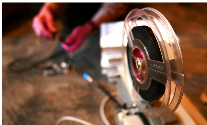
Figure 5. Doing film elicitation: A projector is being prepared for screening in the presence of the researcher.

Despite these deficits, this approach does appear to be fruitful, as researchers and archivists need biographical information about the home moviemakers and the context of the production and reception. Among film scholars, however, the value of the method is still disputed. Cecilia Mörner has described the problem of applying film analysis to unscripted, unedited, and silent movies, and argued in favor of film interviews, since contextualizing production notes and other written sources are usually absent in the case of home movies. 52 Ryan Shand disagrees, arguing that film interviews cannot replace film analysis, but rather produce “another layer of meaning”. 53