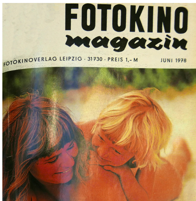
Figure 4. From the mid-1960s cover of the HTDI-Journal FOTOKINO-magazin published regularly images of everyday life.

manuals, and home movies were supposed to contribute to the improvement of society by analyzing leisure activities under socialism. The manual Filmideen fix und fertig ( Ready-to-Go Film Ideas ) added: “How do families live in the GDR? [...] The family is the smallest cell of our state. A lot depends on the right family life”. 46 Filming in private became legitimate only if it served the end of improving socialist society by giving positive examples of family life in the GDR. This concept of home moviemaking lacked any idea of plain, nonpolitical pleasure as a purpose of filming. However, the debate had little influence on the actual behavior of home moviemakers, who still enjoyed filming without any political end in mind. From the mid-1970s onward, manuals display a general acceptance of home moviemaking as a nonpolitical leisure activity (fig. 4). They still give rules for professional filmmaking, but for the sake of “enjoyment” 47 and “amusement” 48 rather than political reasons.