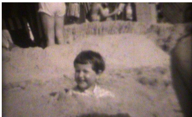
Figure 3. A little girl playing at the beach. Scenes shot during a state funded vacation trip.

included accommodation at a state-funded vacation home, or privately organized trips to campsites. 31 Films of the latter sort included home-abroad scenes, such as preparing and cooking food, eating, and cleaning the dishes. These scenes show everyday routines, which were usually not depicted in movies shot at home. However, comparable scenes are absent in films of state-funded vacations, 32 which feature barely any interior recordings of state hotels but rather scenes of hiking, city trips, or relaxing at the beach (fig. 3). This renders the state support for these vacations invisible, and the choice of perspective and subjects serves to individualize and privatize the state-funded vacations. 33