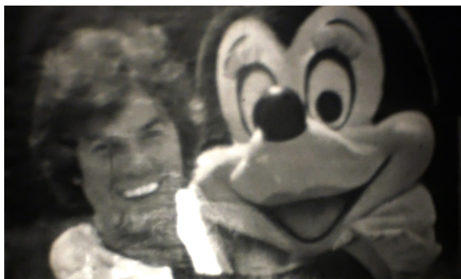
Figure 2. A poster of the West German entertainer Michael Schanze embraced by a Minnie Mouse mascot recorded on an East German film reel.

Union. 28 This meant that teenagers could afford cameras as well, with the result that a new category of images began to appear in East German home movies: symbols of international pop culture. 29 The young Stahlmann used his first black and white film reel to record a West German TV show about the Swedish band ABBA, filming the television with a camera mounted on a tripod. Following this sequence, he pans the camera across the interior wall of his room, on which various posters can be seen. Then he jumps to a close-up, filming details of the images: the guitarist of Deep Purple , several images of the rock band The Sweet , and the West German entertainer Michael Schanze being embraced by a Minnie Mouse mascot (fig. 2). 30 These shots highlight transnational markers of the 1970s youth generation. Filming these symbols in East Germany also meant being part of this international pop culture, despite the political divisions at that time, and allowed the filmmaker to distance themselves from the cultural offerings of the socialist youth organization.