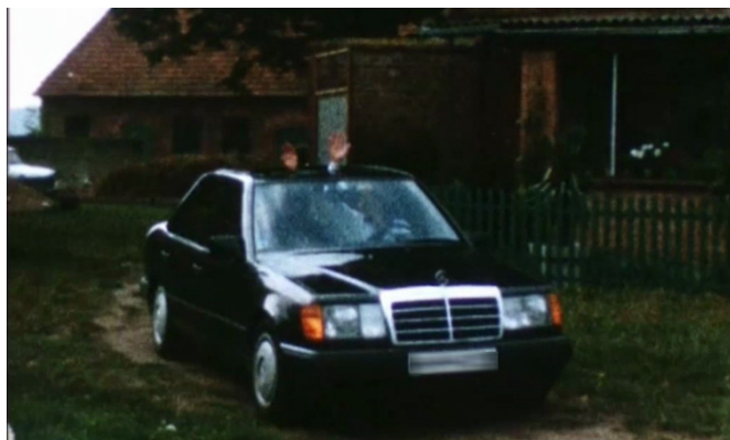
Figure 1. The arrival of West German relatives in a Mercedes Benz. The East German Trabant in the back is almost invisible.

West German car was made the star of this home movie.