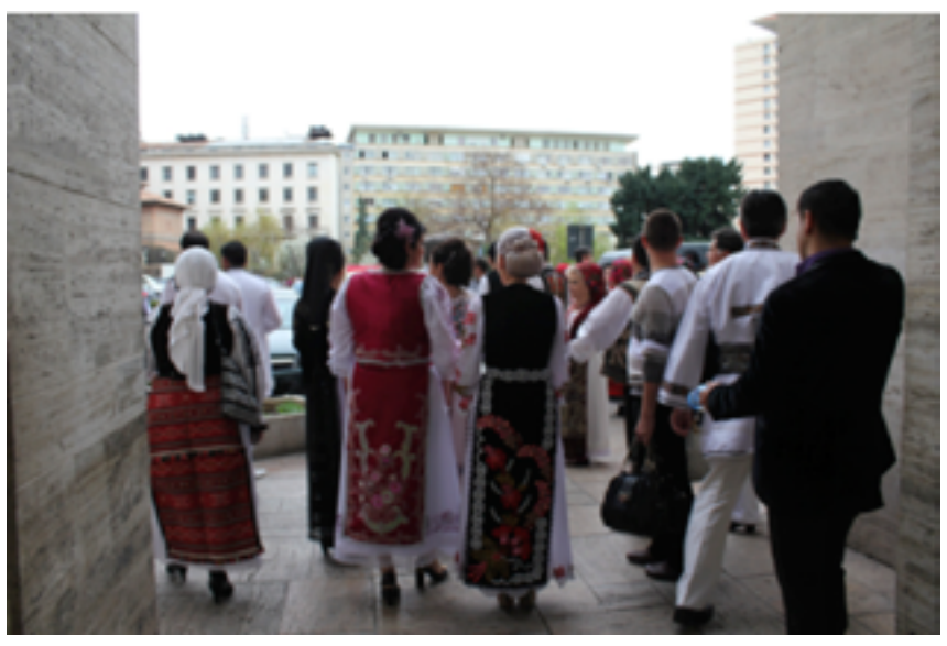
Folklore performers at the backstage entrance, waiting to be picked up by limousines. The large crowd of spectators in the Palace Hall almost matched the number of folklore performers backstage. All

The backstage entrance was not at all far from the main entrance. Anyone curious enough to look around the corner would have been able to see the folklore stars as they went into the building in their street clothes, then emerged in groups, all dressed up in their folk attire, only to be picked up by the limousines, to be driven around the corner to the main entrance. The festival was a cross between Cîntarea României and the Oscars ceremony, all mixed with the Easter celebrations.