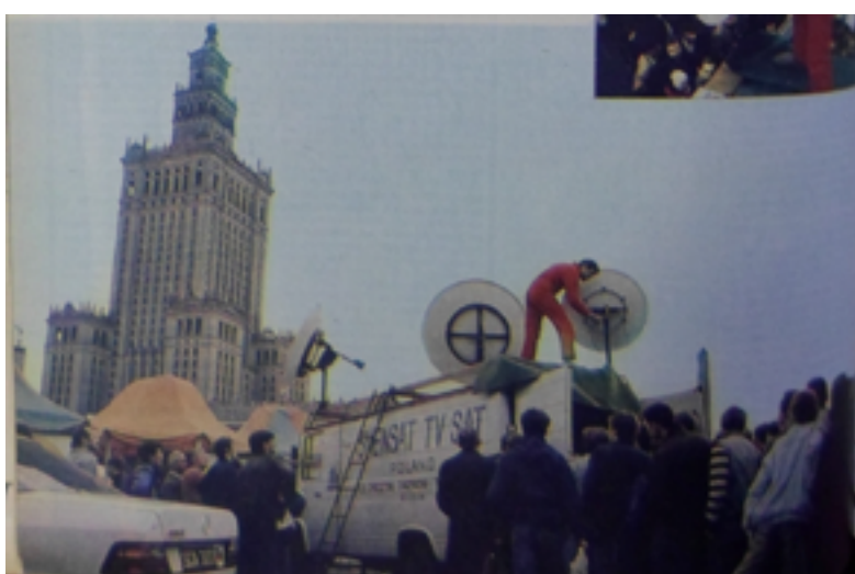
Figure 1. Presentation of satellite television reception organized in Warsaw city center by Svensat company in 1987.

In the years 1987-1988 Polish lifestyle and media-related magazines started publishing regular articles in which Western satellite television was discussed as a breakthrough in the history of television and as a source of highly attractive and colourful content. Such articles also informed on the rise of local, privately-owned companies, which offered satellite receivers. For instance, one of such articles entitled "The satellite television has just been launched" provided information on the open-air public show of satellite reception organized in the centre of Warsaw by Svensat, the first Polish manufacturer of satellite dishes. 12