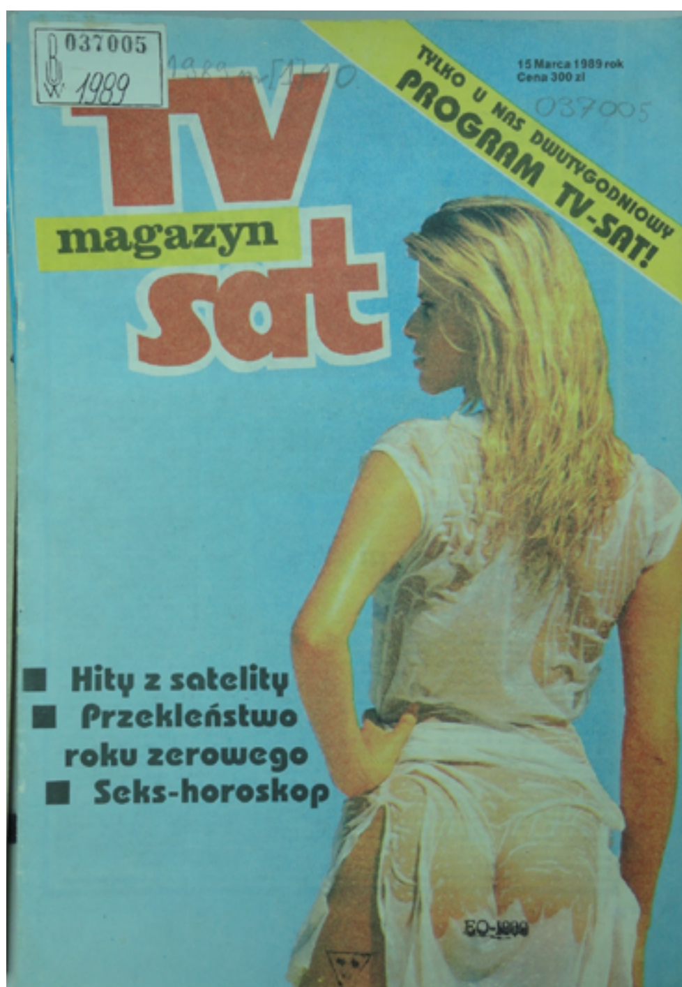
Figure. 3. Cover of the first issue of TV SAT Magazyn from 15 March, 1989.

The first magazine dedicated exclusively to the satellite television was TV SAT Magazyn launched in March 1989. This magazine published the program schedule for the most watched TV channels, technical guides and information on movie stars and artists whose music videos were shown on MTV. This magazine was aimed at male audiences. It not only emphasized the availability of erotic content in satellite broadcasts, but also published in every issue a cover showing semi-naked woman.