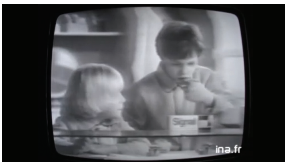
Video 4. Signal: Dentifrice: bactericide [Signal: toothpaste: bactericide], Elida & Gibs, Unilever, 01 January 1970 (INA). Advertisement for Signal toothpaste that used hexachlorophene as a selling point.

the responsibility of advertising, citing an ad for Signal toothpastes that had used the product's hexachlorophene content as a promotional argument since 1969.