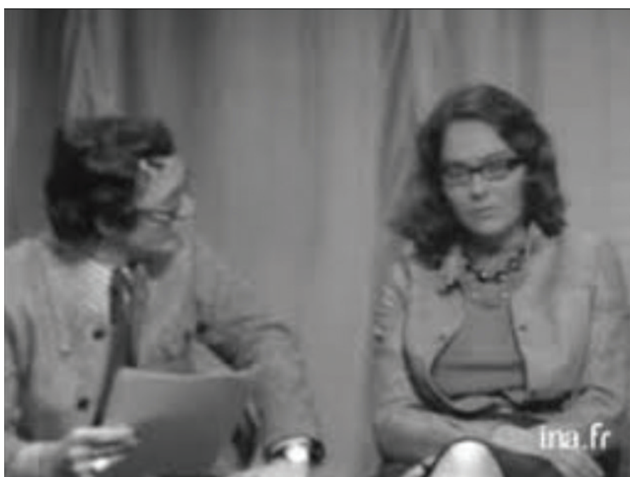
Video 3. 'Affaire talc Morhange' Aujourd'hui Madame, 15 September 1972, Deuxième chaine ['Morhange talcum affair' Today Madame, broadcast on France's second channel]. This was the first televised debate on the Morhange scandal.