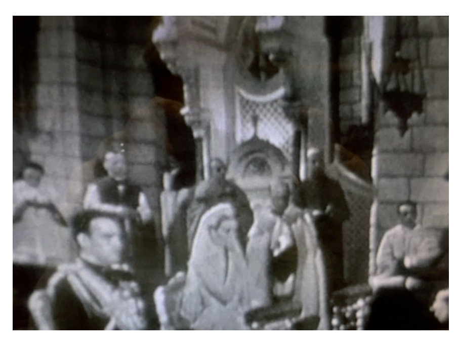
Figure 4. Grace Kelly her dabbing at her eye with a handkerchief during the ceremony as covered by television; screenshot of the 16 April 1966 edition of BBC2's Plunder .

Figure 3. Close-up of Grace Kelly during the ceremony as covered by television; screenshot of the 16 April 1966 edition of BBC2's Plunder.