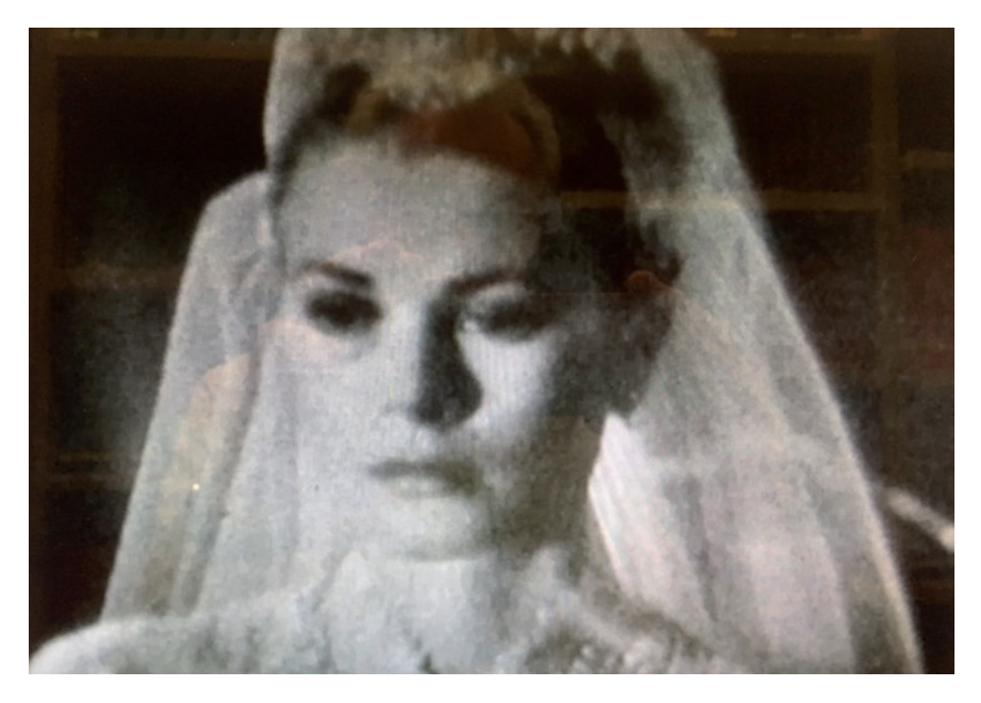
Figure 3. Close-up of Grace Kelly during the ceremony as covered by television; screenshot of the 16 April 1966 edition of BBC2's Plunder.