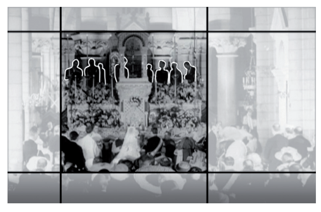
Figure 1. A technical rehearsal took place before the event so that the lighting would clearly illuminate the groom and bride in her ivory dress. Microphone positioning was particularly important for the TV coverage, and priests were recruited to move them when necessary.

The two British newsreel companies, Pathe and Movietone, ended up by showing less than their two minutes' ration of footage from the cathedral. Pathe ran a three and a half minute item with just less than half showing events inside