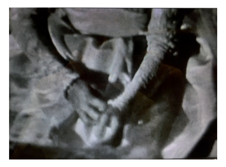
Figure 5. Grace Kelly replacing the handkerchief into her left sleeve during the ceremony as covered by television; screenshot of the 16 April 1966 edition of BBC2's Plunder .