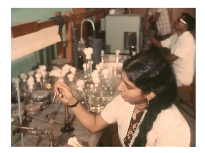
Video 6. Episode 1, Indus Valley to Indira Gandhi (Krishnaswamy Associates, 1976).