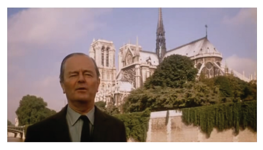
Video 1. Episode 1, 'The Skin of Our Teeth,' Civilisation (BBC-2, 1969).

One of the first shows to revolutionise educational broadcasting on BBC-2 was the above-mentioned Civilisation . Presented by the acclaimed historian of art and the wartime Ministry of Information bureaucrat Kenneth Clark, the show fulfilled diverse functions. On the one hand, it was an educational show that pedantically studied important historical periods of Western European art; on the other hand, it was a revived celebration of Western civilisation. By televising original historical sites and museums, the show provided an expanded vision of Western cultural heritage equally suitable for the growing colour TV industry. Likewise, Malle's Phantom India was both a visually rich exploration of "an exotic land" as well as an authoritative account of Britain's most important ex-colony. Colour television, specifically in Phantom India , managed to fuse and make evident the newly formed relationship between the modern expansion of capital with older notions of colonial exploration.