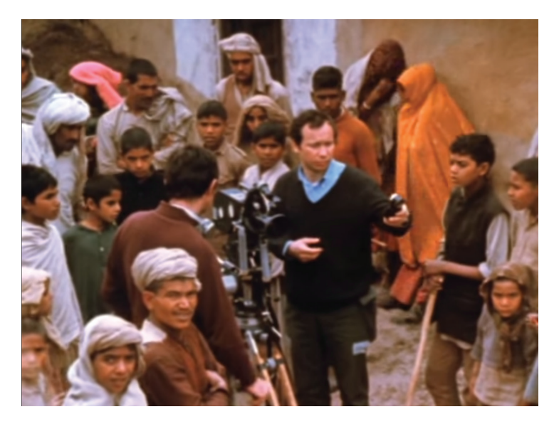
Video 2. Episode 1, 'The Impossible Camera,' Phantom India (BBC-2, 1970).

Scholars have defined this sensitivity in cultural production as redemptive. In other words, European art cinema appropriated modernist filmmaking techniques to make sense of the post-imperial moment.<sup>23</sup> For example, Phantom India mimics the old colonial genre of travel writing while also self-consciously "liberating" it from the constraints of the dominant Western gaze; the series seemingly invites a returned gaze. By undermining the importance of the Indian elite and the expert class in post-1947 India, Malle's documentary fixates on the subaltern. Malle's on-screen voyage fixates on, what Ranjani Mazumdar termed, "the spectacle of inequality."<sup>24</sup> The series represents India as a paradox as it relies on the one hand, a well-read and well-educated middle-class, while on the other hand, slave-like labour.<sup>25</sup> Such stark dichotomies constitute an experience of "shock" present in the logic of modern Indian cities. However, Malle does not employ the distanced perspective, akin to the Bombay film spectacles that utilise the aerial shot as a disciplining, almost Panopticon-like, function of transforming the unruly into observable and controllable subjects. Reminiscent of the cinema vérité style, Malle's camera glides through the crowd and establishes its veracity by supposedly becoming one with the ordinary, the crude, and the everyday.