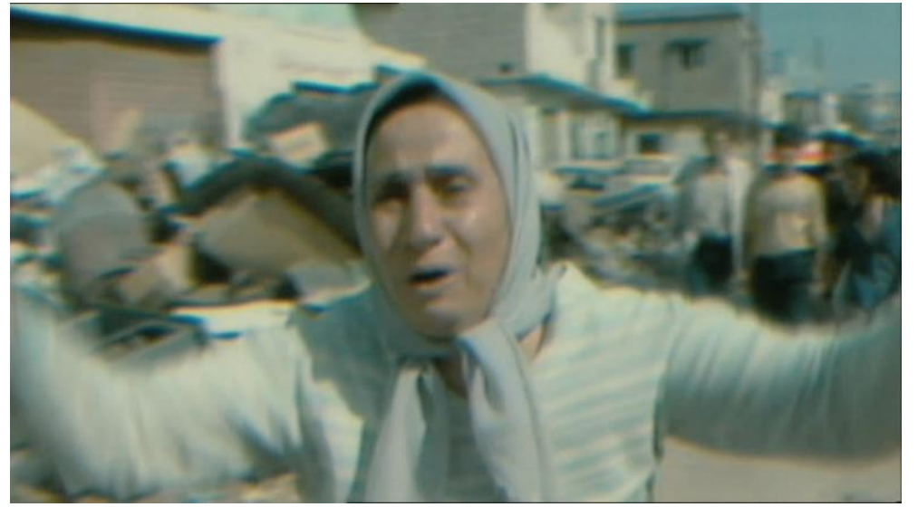
Figure 30. WALTZ WITH BASHIR, Ari Folman, ISR/F/D/USA/FIN/CHE/BEL/AUS 2008

In the foregoing analysis, I have shown how sound design is an autonomous dimension of film design. In the form of the 'sonic histosphere', sound design models history, makes it a palpable object of experience and prompts critical reflection. Film sound thus not only plays a key role in constructing filmic representations of history, but also in critically questioning and reinterpreting these representations. This is a topic that requires further detailed research.