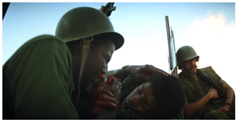
Figure 18. APOCALYPSE NOW, FRANCIS FORD COPPOLA, USA 1979

The sequence makes use of various audio-visual techniques to arouse emotion. In the following, I examine these techniques with particular attention to sound design. Most of the auditory affects bear no direct semantic relation to the filmic reality (the characters' reality). Freed from a conceptual connection to their source or a specific semantic code, sounds can trigger a direct emotional