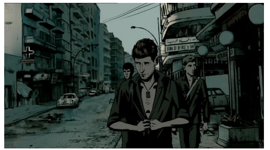
Figure 21. WALTZ WITH BASHIR, Ari Folman, ISR/F/D/USA/FIN/CHE/BEL/AUS 2008