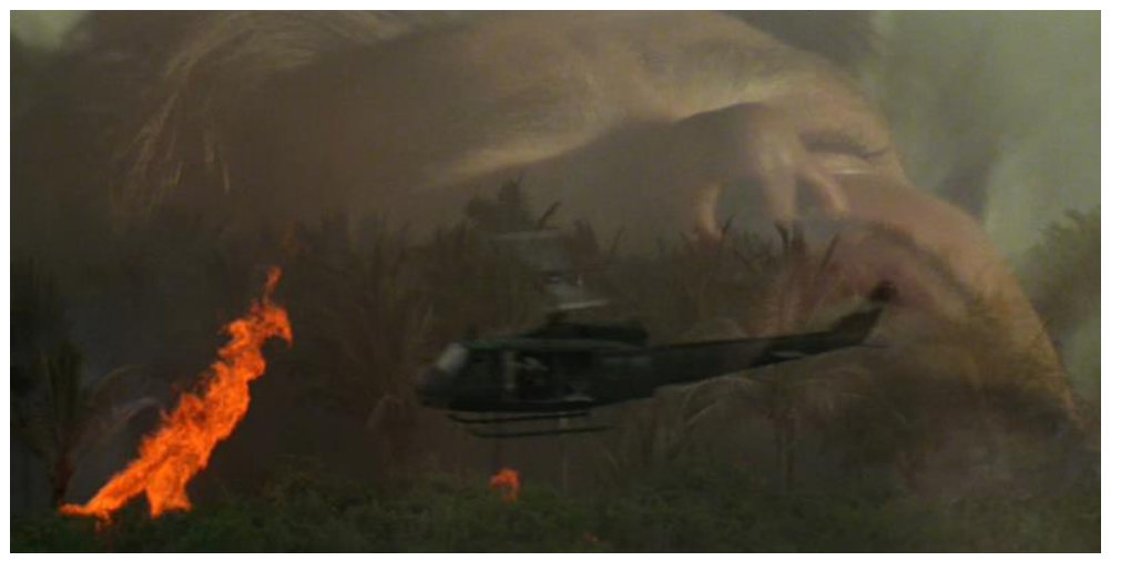
Figure 15. APOCALYPSE NOW, FRANCIS FORD COPPOLA, USA 1979

The helicopter noise functions as another type of auditory reminiscence trigger. It awakens spectators' memories of distorted perceptions during states of delirium— or representations of such states in films. It also serves as a leitmotif, as a bridge between present and past reception of the film.<sup>80</sup> The interaction between image and sound in the opening sequence creates a 'synchresis effect'<sup>81</sup> that combines simultaneously occurring sound and visual effects into a whole. As a result of this effect, individual audio or visual elements from the sequence will spontaneously remind spectators of the event in its entirety even if these elements only recur in isolation later in the film. In APOCALYPSE NOW, the potentially unsettling audio-visual design of the opening sequence simulates a traumatization of the spectator and remains unconsciously lodged in their memory, waiting to be recalled. Consequently, in later sequences a single audio element, such as the sound of a helicopter, is enough to make the spectator associate the sequence with images of fire, destruction and loss of reality.