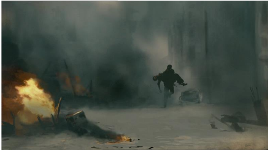
Figure 26. WALTZ WITH BASHIR, Ari Folman, ISR/F/D/USA/FIN/CHE/BEL/AUS 2008

artificial, detached photography (and, later, to moving images too).