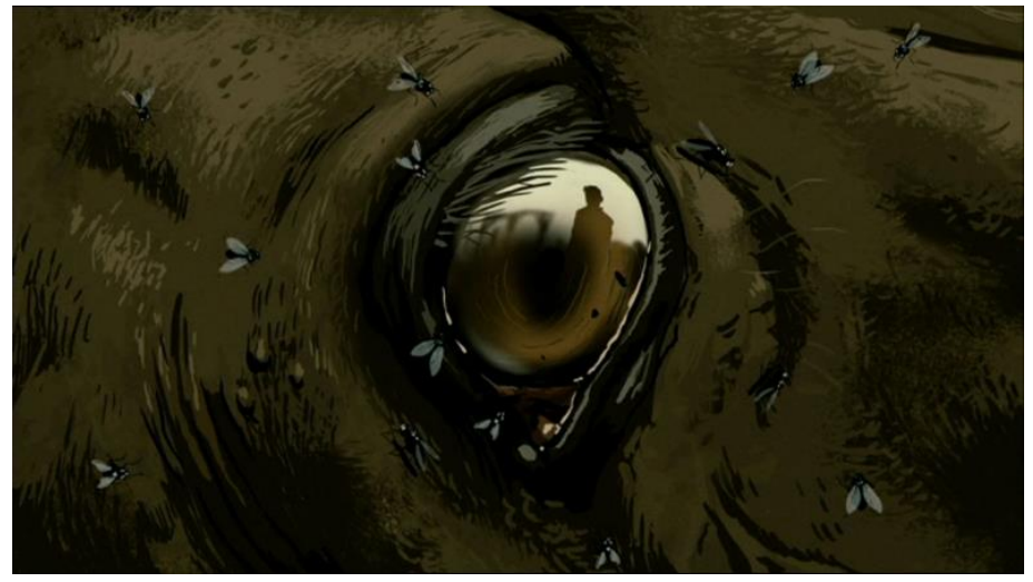
Figure 28. WALTZ WITH BASHIR, Ari Folman, ISR/F/D/USA/FIN/CHE/BEL/AUS 2008