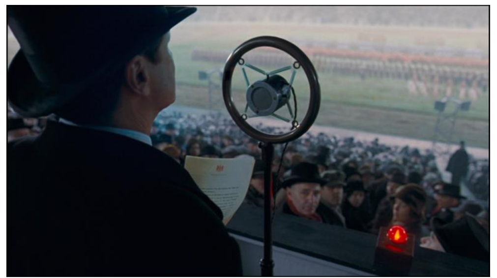
Figure 2. THE KING'S SPEECH, Tom Hooper, UK/USA/AUS 2010

Noises in particular possess great evocative power, which is a more important determinant of film's capacity to influence conceptions of history than how closely these noises resemble the historical sounds and tones they purport to represent. Accordingly, auditory world-building is based primarily on the use of noises that stir the spectators' emotions. In addition, noises can function as auditory metaphors that have a significant impact on film's representation and interpretation of history.<sup>30</sup> In the opening sequence to THE KING'S SPEECH, Albert (Colin Firth) is supposed to give a speech at the closing of the British Empire Exhibition in Wembley Stadium as a representative of the Royal Family. His attempt to speak is thwarted by high-pitched interference from the microphone, which causes Albert to descend into scarcely comprehensible stammering. The impression of vulnerability and exposure in a vast space is further reinforced by the use of strong reverberation.