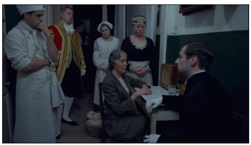
Figure 5. THE KING'S SPEECH, Tom Hooper, UK/USA/AUS 2010