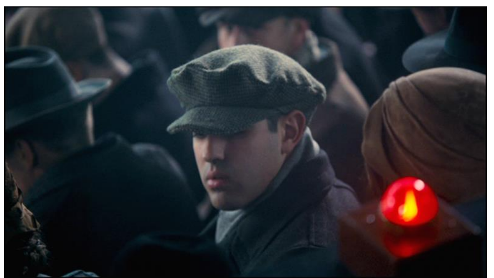
Figure 10. THE KING'S SPEECH, Tom Hooper, UK/USA/AUS 2010

The melancholy string and piano music reinforces the feeling of humiliation. However, the music is not just a commentary, but also an expression of the sequence's emotional force. As well as modelling the historical event, the sound design also models Albert's personal tragedy and its contemporary public reception. This gives the film's protagonist an emotional profile that also affects how the underlying historical events and figures are interpreted. Having the spectators endure the unpleasant situation "with" Albert has the potential to increase the sympathy they feel for the historical figure depicted by the film.