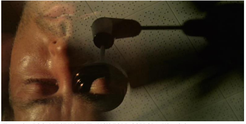
Figure 13. APOCALYPSE NOW, FRANCIS FORD COPPOLA, USA 1979