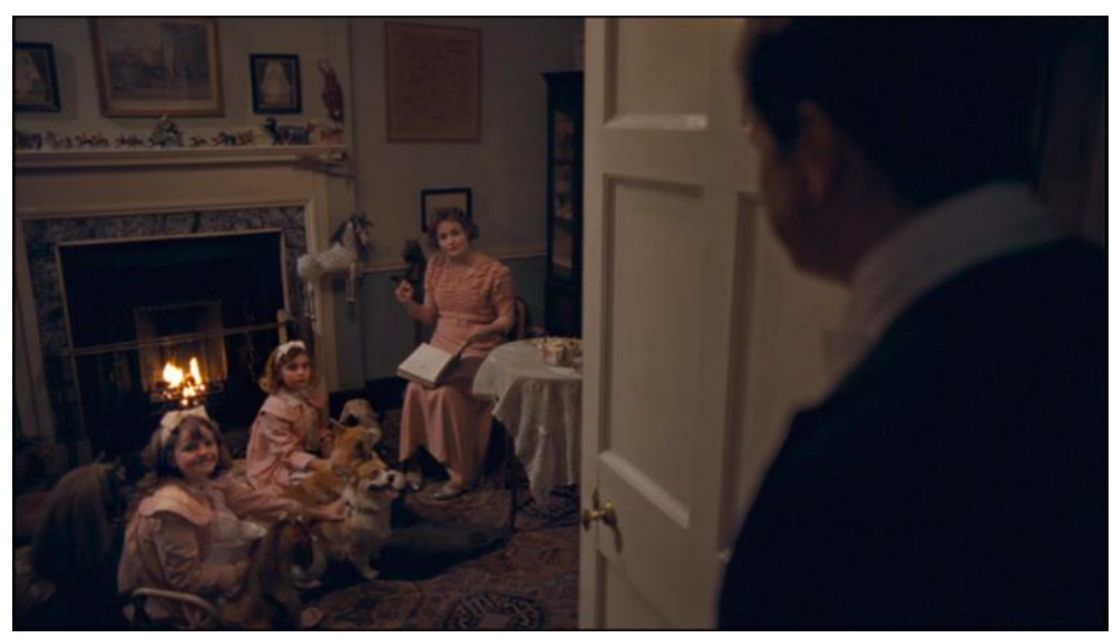
Figure 3. THE KING'S SPEECH, Tom Hooper, UK/USA/AUS 2010

Ambience also has the potential to link history to the physical space in which it is represented in film. This can be observed in THE KING'S SPEECH too. In another sequence, Albert enters a private room in his palace where his wife (Helena Bonham Carter) and two young daughters are waiting for him. He tells the children a bedtime story. The ambience is characterized primarily by the steady blazing and crackling of the fire in the hearth. The soothing effect of this background noise characterizes the private room as a place of refuge. This models not only the specific filmic location where the characters find themselves, but also the relationship between the characters. The film thus offers a historical reconstruction of the everyday reality and interpersonal relations of a member of the Royal Family in the 1920s, and presents this intimate sphere, by way of contrast with public life, as a space of safety and security.