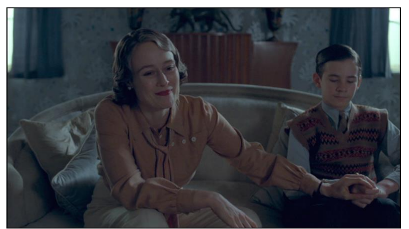
Figure 4. THE KING'S SPEECH, Tom Hooper, UK/USA/AUS 2010

Film sound enables spectators to travel through not just space but also time and to immerse themselves in the bygone era constructed by film. The 'sonic histosphere' is anchored in a particular historical period through orienting sounds and complex soundscapes. Historical films also create a specific chronology through their temporal arrangement of the historical events that they depict. In this process, film sound often serves an amalgamating function, linking filmic spaces together and establishing continuity. One example of this can be seen in the final radio broadcast at the end of THE KING'S SPEECH, where Albert speaks live to the people of Britain. Shots of Albert speaking in the recording booth are intercut with images of people throughout the country listening to him raptly, creating a public that film spectators can also be a part of. Colin Firth's voice runs through the montage and links the shots together.