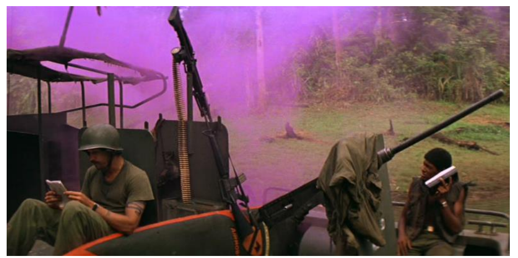
Figure 16. APOCALYPSE NOW, FRANCIS FORD COPPOLA, USA 1979