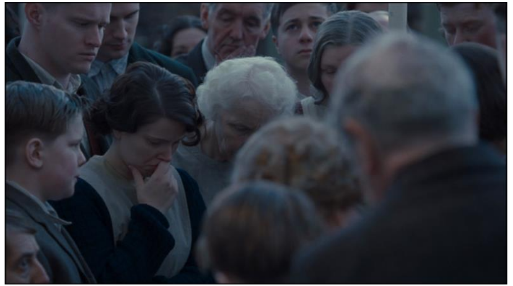
Figure 6. THE KING'S SPEECH, Tom Hooper, UK/USA/AUS 2010

By repeating the live experience, the film makes the past immediately present. At the same time, by linking together shots of the king with images showing a cross section of the British people, the sound forms a community, an experience of collective memory. History is re-enacted as a media event. The choice of music also reinforces the impression that one is experiencing a moment of great historical significance. Instead of a conventional film score, Ludwig van Beethoven's Symphony No. 7 is used.<sup>42</sup> Despite being an anachronism, this choice of music taps into a collective cultural memory, to which the film sequence is then linked. Furthermore, it suggests to spectators that they are witnessing the creation of a historical audio document. However, THE KING'S SPEECH does not use the actual historical recording of George VI's speech, but an audio re-enactment with Colin Firth's voice. Accordingly, the sequence can be described as a filmic representation of history in the making: the auditory modelling of the king's voice synchronizes space and time, establishing historical continuity.