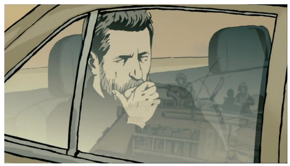
Figure 25. WALTZ WITH BASHIR, Ari Folman, ISR/F/D/USA/FIN/CHE/BEL/AUS 2008

Benjamin Beil refers to this kind of "merging of past and present, of unreal and real in a 'shared filmic space'"<sup>106</sup> as a "mindscape":