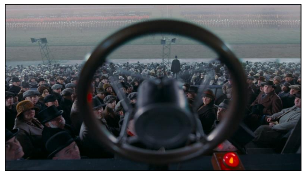
Figure 7. THE KING'S SPEECH, Tom Hooper, UK/USA/AUS 2010

his lips as they struggle to form words. These non-verbal bodily sounds are enough to trigger a direct emotional response in the spectators and generate a bond of empathy. In addition, extreme close-ups from Albert's point of view also make it easier to empathize with the situation of the struggling speaker, who stares helplessly at the oversized, menacing-looking microphone.