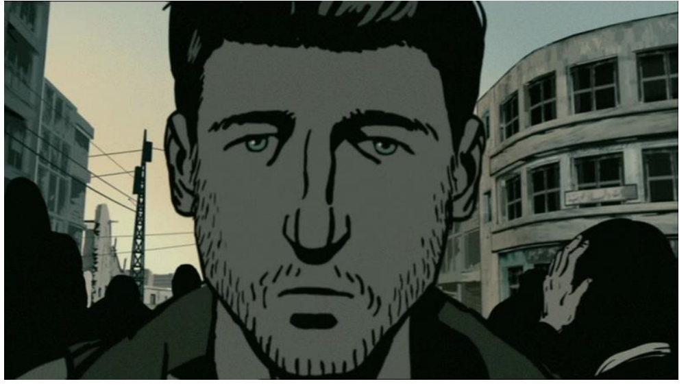
Figure 23. WALTZ WITH BASHIR, Ari Folman, ISR/F/D/USA/FIN/CHE/BEL/AUS 2008