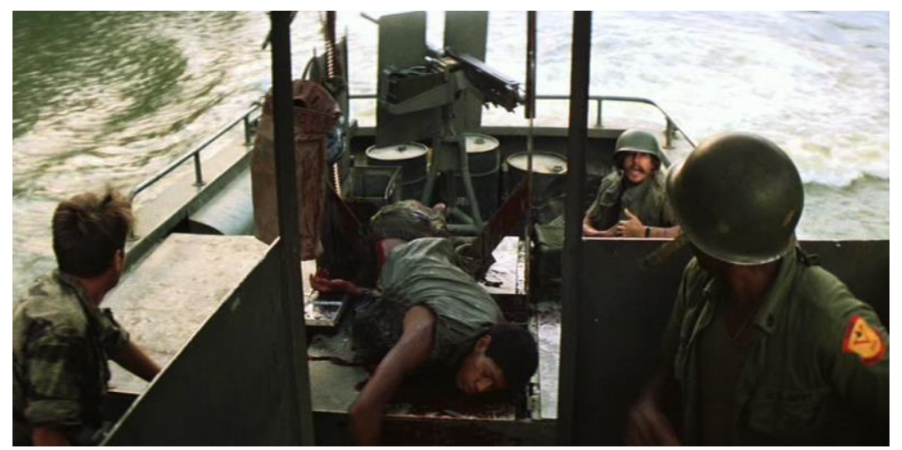
Figure 17. APOCALYPSE NOW, FRANCIS FORD COPPOLA, USA 1979