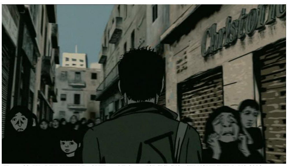
Figure 22. WALTZ WITH BASHIR, Ari Folman, ISR/F/D/USA/FIN/CHE/BEL/AUS 2008