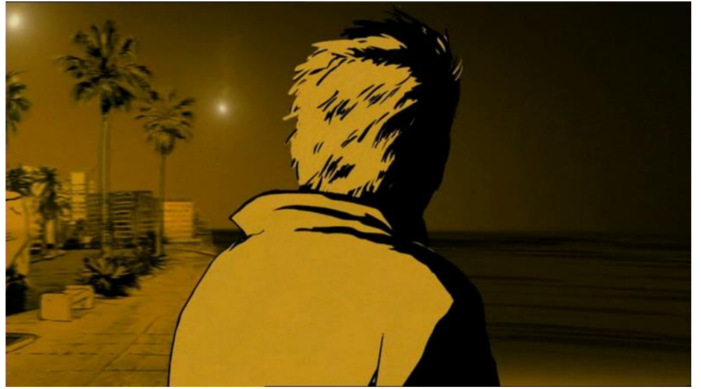
Figure 19. WALTZ WITH BASHIR, Ari Folman, ISR/F/D/USA/FIN/CHE/BEL/AUS 2008

Kooij observes that "noise and the sea have become a closely twinned metaphor of disorder, of chaos; symbols of the totality that the lens constantly encompasses but will never entirely capture."<sup>104</sup> In WALTZ WITH BASHIR, the drumming of the rain and the roar of the sea symbolize the release of disordered flows of memory mixed with imaginary visions. When Ari drives away in his car afterwards, this release gives way to a process of reflection. The regular sound of the windscreen wipers functions like a metronome, giving structure to the haunting soundscapes, which now grow in intensity. In a contextualizing, reflective voice-over, Ari identifies the cause of the fragments of traumatic memory for the first time: the war in Lebanon. Eventually, he gets out the car and stands on the promenade. As he stares at the waves beneath the night sky, the camera pans and the promenade is transformed into the shoreline of Beirut.