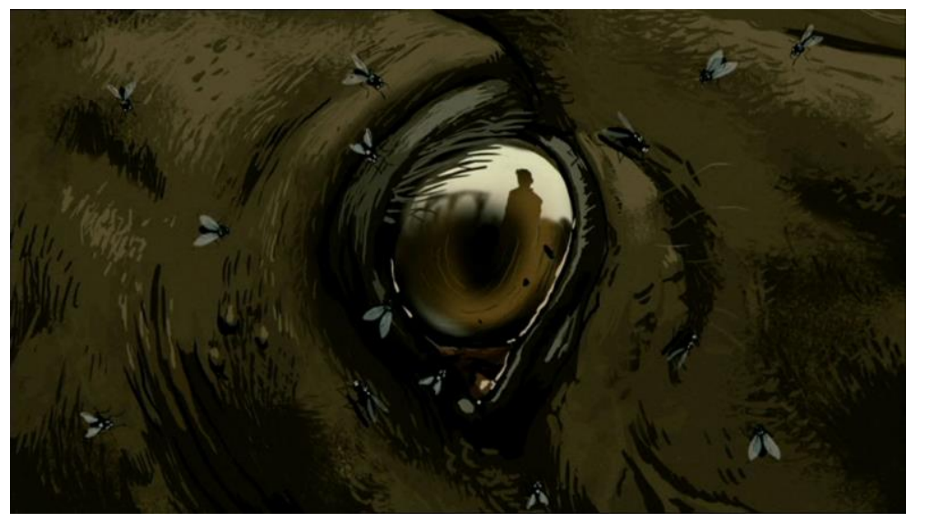
Figure 1. WALTZ WITH BASHIR, Ari Folman, ISR/F/D/USA/FIN/CHE/BEL/AUS 2008