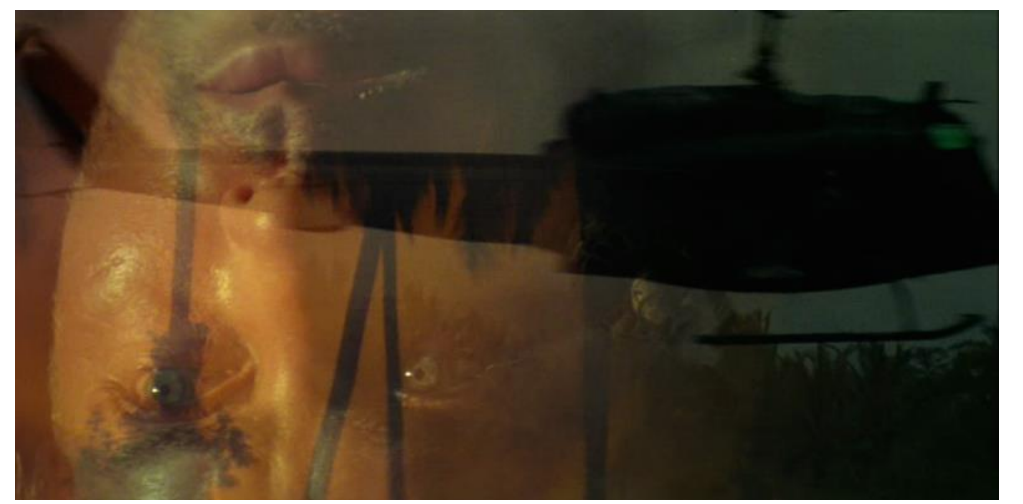
Figure 12. APOCALYPSE NOW, FRANCIS FORD COPPOLA, USA 1979