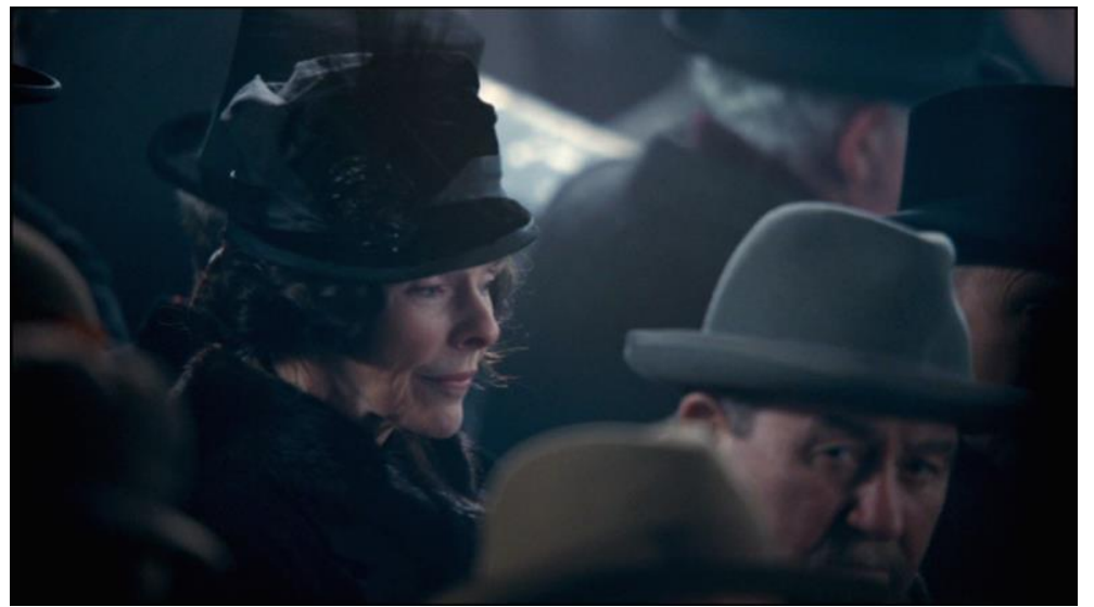
Figure 9. THE KING'S SPEECH, Tom Hooper, UK/USA/AUS 2010