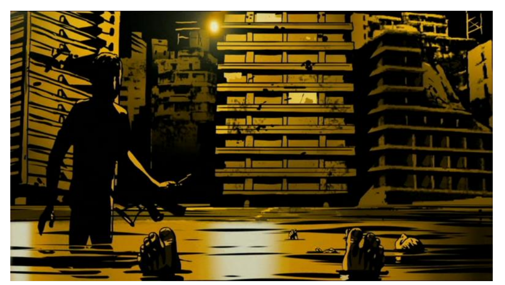
Figure 20. WALTZ WITH BASHIR, Ari Folman, ISR/F/D/USA/FIN/CHE/BEL/AUS 2008

104. Fred van der Kooij: "Wo unter den Bildern sind die Klänge daheim? Das Orten der Tonspur in den Filmen von Jean-Luc Godard". In: Cinema , 37, 1991, p. 24.