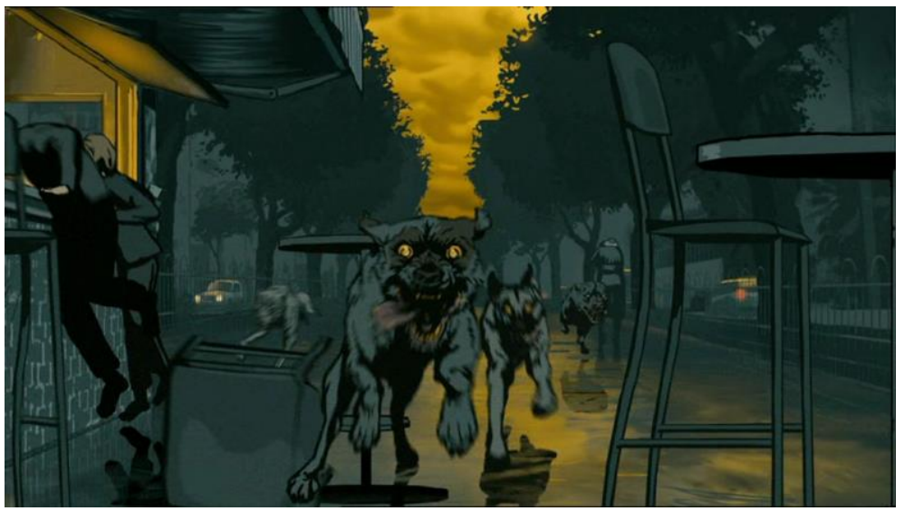
Figure 24. WALTZ WITH BASHIR, Ari Folman, ISR/F/D/USA/FIN/CHE/BEL/AUS 2008

Another example shows that the repeated use of a piece of music does not necessarily mean that the sequence that is linked to the music will be repeated in full. When Ari is taking the taxi back to the airport after visiting his friend Carmi in the Netherlands, a bass-heavy beat is played that is very similar to the one that accompanies the opening sequence of dogs rampaging through the city. Ari looks out the window of the car, thinking to himself. Suddenly, the reflections in the glass no longer show the bare trees of the Dutch winter landscape, but instead palm trees and an armored transport.