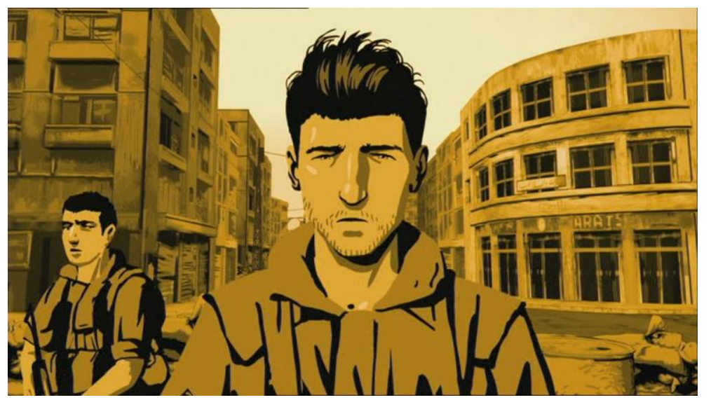
Figure 29. WALTZ WITH BASHIR, Ari Folman, ISR/F/D/USA/FIN/CHE/BEL/AUS 2008