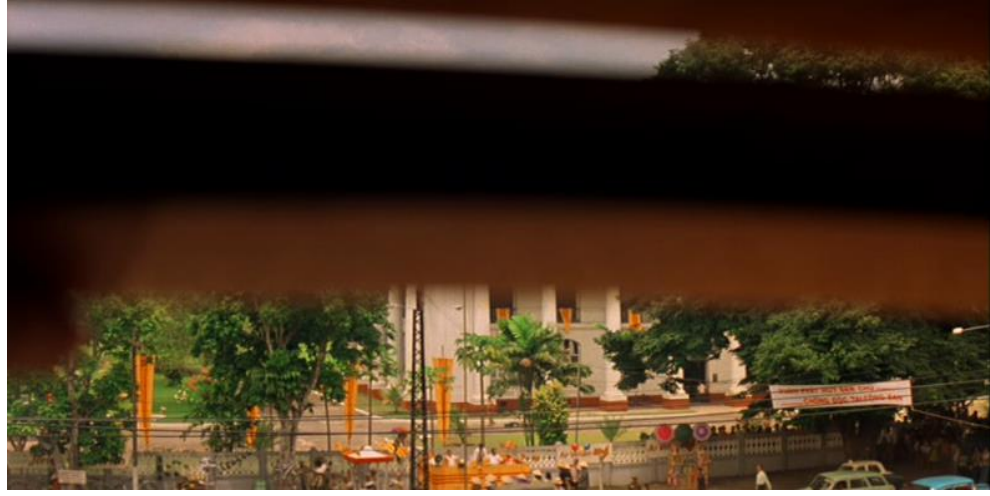
Figure 14. APOCALYPSE NOW, FRANCIS FORD COPPOLA, USA 1979

While the music amplifies the blending of per ception, memory and imagination, and hence reinforces the impression of su bjective experience, the increasingly loud and concrete sound of the rotors ush ers in a brief awakening from the fever dream. The superimposed images disap pear and the music falls silent, but, as Flückiger notes, "in the brief moment in which the sounds are given a realistic touch, the picture adopts a subjective perspective as a PoV; a shift occurs from auditory to visual subjectivisation".<sup>70</sup> Willard peers through the slats of a blind.