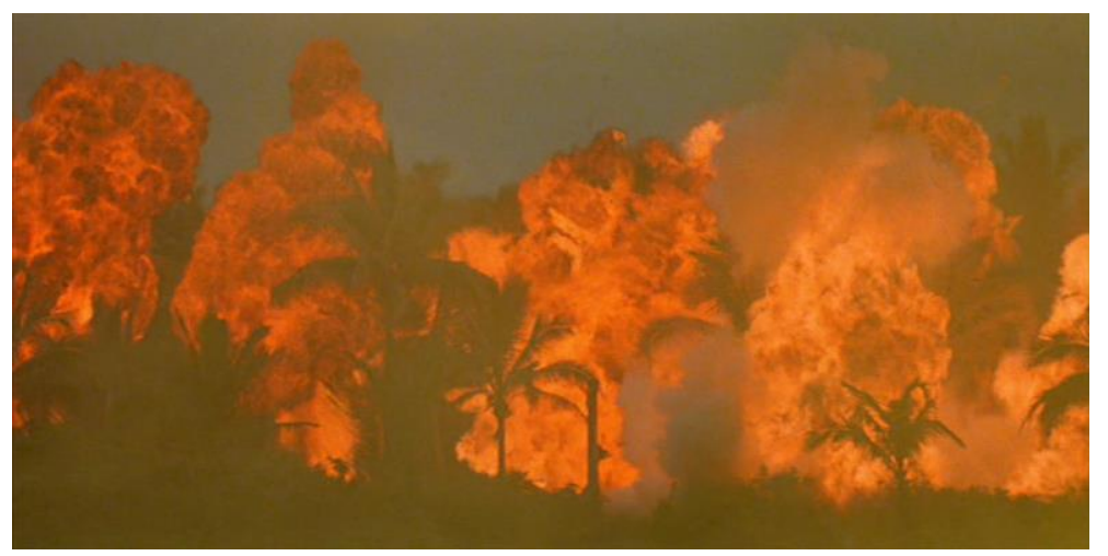
Figure 11. APOCALYPSE NOW, FRANCIS FORD COPPOLA, USA 1979

Right from the outset, APOCALYPSE NOW's soundtrack interacts dynamically with the visual dimension. The first guitar chords and percussion effects from the Doors' hit "The End" are mixed with a whirring, rhythmic sound that gradually gains substance. We can see a thick jungle with yellow smoke in the foreground. The skids of a helicopter glide through the extreme foreground, out of focus. By means of a stereo effect, the whirring sound follows the helicopter across the screen, thus linking the sound to the helicopter. The jungle erupts into flames almost exactly in time with the first line of the song: "This is the end/Beautiful friend". Sound and text reciprocally comment on each other. Shots of the burning jungle are superimposed over a close-up of Captain Willard and a ceiling fan seen from his point of view.