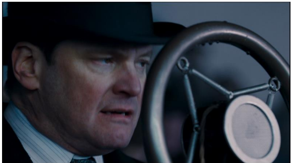
Figure 8. THE KING'S SPEECH, Tom Hooper, UK/USA/AUS 2010

A cut to the BBC recording studio and the analogue crackle of a sound engineer's headset pile on even more pressure. Even the radio (the defining mass medium of this period) seems to be waiting for Albert to speak. The barely articulated fragments of words that follow are garbled to the point of incomprehensibility by the reverberation and the technical distortion of his voice. The piercing, dissonant noises that result feel like a quasi-physical assault on the spectators, who will find the situation just as unbearable as Albert and the irritated-looking spectators in the stadium, between whom the film cuts back and forth.