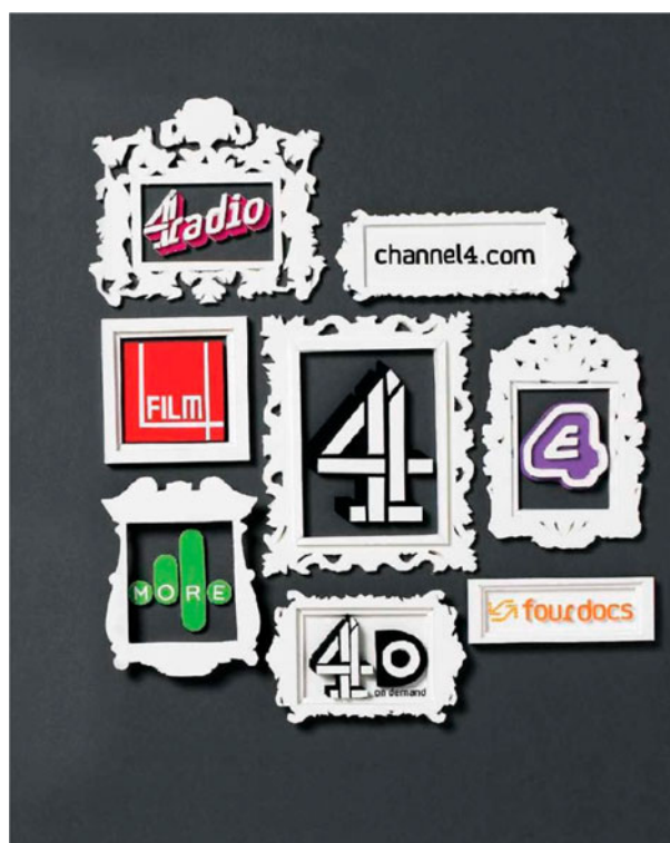
Fig. 3 This page from the 2006 Channel 4 Annual report illustrates the segmentation of the corporation into convergent media outlets

Emphases and absences in annual reports are particularly telling. FilmFour Ltd. is conspicuously absent from the 2002 report, the year in which it had been drastically cut back. However, where this document spends several pages explaining the meaning of multi-channel television to justify C4's convergence strategy, in 2003 and particularly 2004, the focus is on the public service remit of the core (terrestrial) channel, with FilmFour and the other non-television services downplayed. The year 2005 continues to stress public service, but begins to apply it to the entire C4 portfolio, describing its newly launched digital More4 service 'a public service channel for the 21 st century'. By 2006, C4 was envisaged as a convergent television brand, with the chairman's statement illustrated with an image of the diverse media outlets under the broadcaster's auspices.