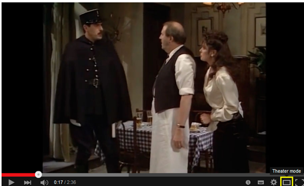
Video 2. Click here to watch it.

The creative decision that probably killed the film's chances was the use of 'Franglais' – to have characters speak in accented English rather than in French. In a story about the ability of the protagonist to assimilate seamlessly into a foreign society, this seemed silly. For British reviewers of the film, the temptation to compare it to the 1980s sitcom Allo Allo (which was also set in occupied France with actors speaking 'Franglais') was too strong. International sales meant that it broke even despite a lukewarm domestic box office performance, but the film did not provide the financial windfall for which it was designed. Targeted too squarely at the international market, it was not distinctive or edgy like Channel 4 films had previously been.