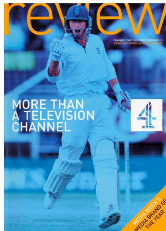
Fig. 1 Front cover of C4 2000 Annual report. Its tagline reads 'More than a Television Channel.'

a strategy to secure its finances and fulfil its challenging remit. Spearheaded by a dynamic Chief Executive in Michael Jackson, the Channel 4 Television Corporation (C4) expanded into various media-related businesses. It wanted to become, as the 2000 Annual Report boldly stated, 'More than a Television Channel.' In other words, the channel intended to become an all-purpose, convergence-friendly multimedia operation. C4 apparatchiks posited the spending during this period as a necessary investment to secure the broadcaster's future in a digital marketplace, but most of it provided neither the financial sustenance to keep C4 buoyant nor the prestigious or socially useful content a public service broadcaster should bring into being.