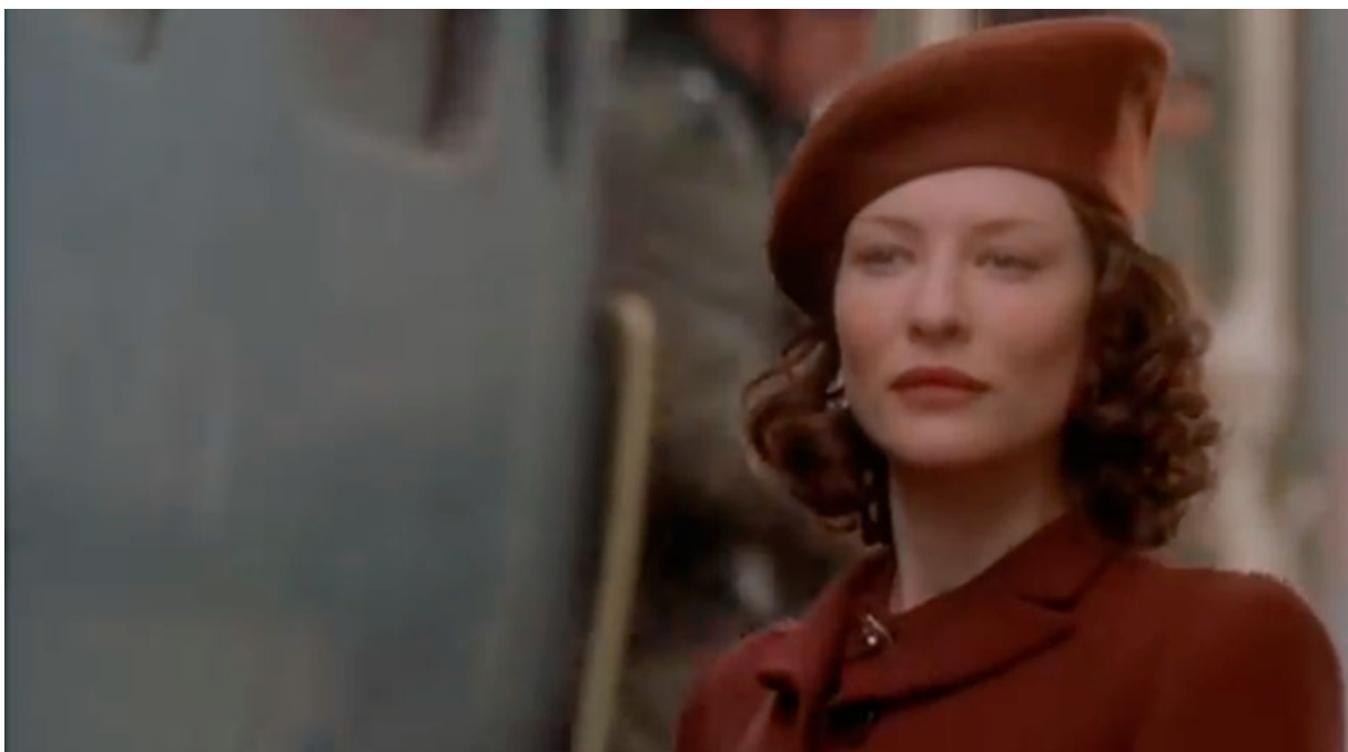
Video 1. Click here to watch it.

Pursuing the commercial market meant creative compromises, which weakened the films, which were often glossy but depthless. The best example is the film most frequently cited as the cause of FilmFour's eventual demise, Charlotte Gray (Gillian Armstrong, 2001). With a budget upwards of £15 million, it was the most expensive independent film ever made in Britain. Its North American distributors, Warner Brothers unwisely opted for a December opening, hoping that this would produce the awards nominations that were increasingly central to marketing prestige dramas. Awards committees were not convinced, even by the acting of the usually admired Cate Blanchett in the lead role. As the preponderance of close ups of Blanchett in the trailer for the film demonstrates, it was sold to audiences on her star persona of outstanding acting talent and beauty.