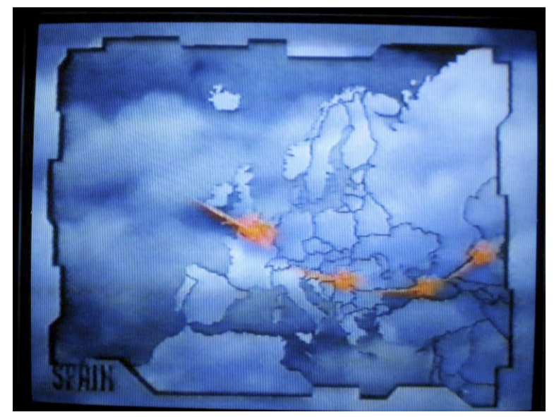
Fig. 2. ESC 1996, NRK 18 May 1996

The European maps of the ESC create an ever-widening image of Europe. The framing in the 1996 map is already wider than in the 1963 ESC, showing all the Nordic countries as well as some of Northern Russia, North Africa and the Middle East.