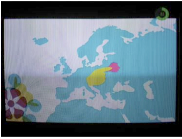
Fig. 3. ESC 2007, YLE 12 May 2007

At the beginning of the 2000s the boundaries of the maps moved further south and east and by 2007 the map extended even further to accommodate new participants Armenia and Georgia. Thus the ESC's image of Europe became more inclusive: Western Europe lost its central position and participating countries were not left in the margins visually. The maps also give increasing room to North Africa and the Middle East, highlighting the fact that Europe has no clear boundaries.