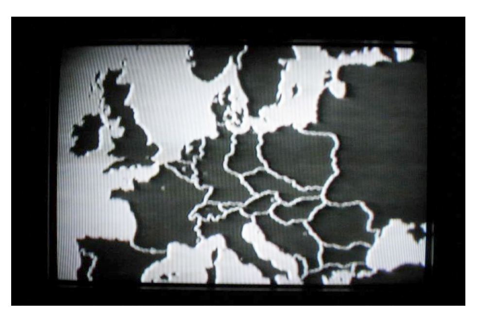
Fig. 1. ESC 1963, BBC 23 March 1963

During this period the European map was rarely used as a visual element in the ESC. When it was, the maps ignored the Cold War division in Europe that otherwise structured the contest. The 1963 ESC introduced the entries with a map of Europe.