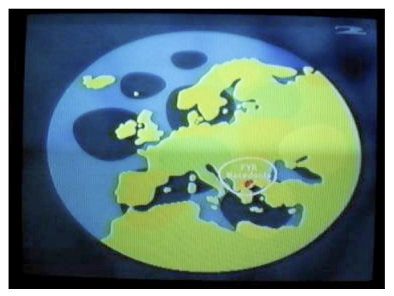
Fig. 4. ESC 2002, ETV 25 May 2002

featured national borders, since 2001 these have been left out (apart from a customary zoom-in to the country whose votes will be shown next). The 1998, 1999 and 2001 maps differentiated the participating countries from non-participants with different colours, producing very patchy images of Europe. Since 2001, when the ESC was held in the former Intervision territory for the first time, the maps have not singled out participating countries. Thus, the ESC maps produce a stylized image of Europe with no clear boundaries, emphasizing unity over national borders.